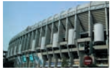
Real Madrid Football Stadium

If you are not a member of the INTERNATIONAL SOCIETY OF DACRYOLOGY & DRY EYE notice that the ISD&DE has no annual fee. The members only must pay the registration fee to the congress if they attend them. Are you interested to become a member of the ISD&DE, whether you attend the 8th Congress or not? YES ( ) NO ( )