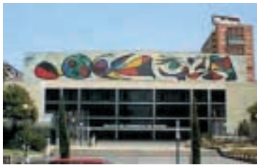
Palacio de Congresos