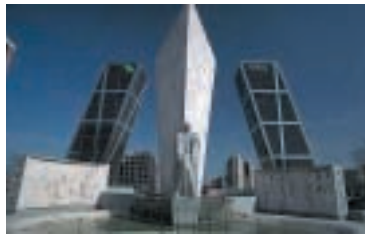
Paseo de la Castellana